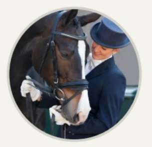
Events MULTIPLE EVENTS ANNUALLY WITH ATTENDANCE OPEN TO OVER 3,000 MEMBERS ACROSS CALIFORNIA